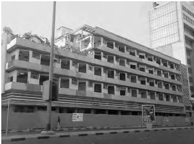
FIGURE 12. The demolition of the modernist buildings along Fahad al-Salem Street in 2008.

creased FARs exponentially, allowing buildings to rise up to a maximum of 100 stories, depending on plot size. This led to a flurry of demolition and construction activity, as the iconic lowrise modernist landscape was rapidly replaced by more profitable glass-and-steel highrises (FIGS. 11–13).