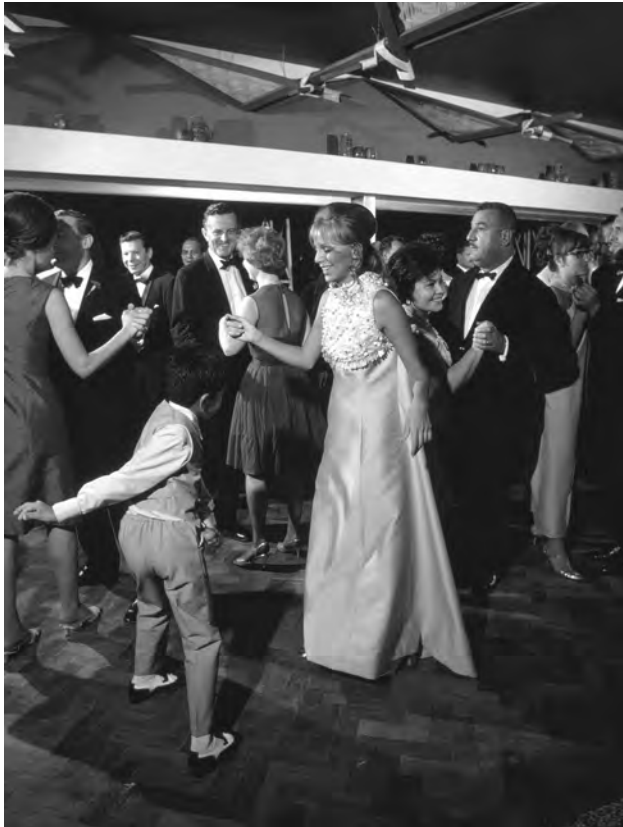
FIGURE 4. Dancing at the seaside Gazelle Club in the 1960s.