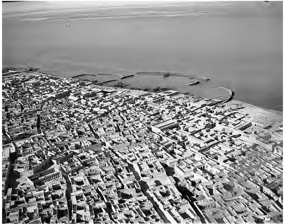
FIGURE 1. Kuwait's pre-oil townscape.

as the ultimate symbol of Kuwait's newfound prosperity. Accordingly, the vast majority of the pre-oil urban landscape was subsequently demolished throughout the 1950s and 1960s (FIG. 3). This process of "out with the old and in with the new" was common to universal experiences of modernity