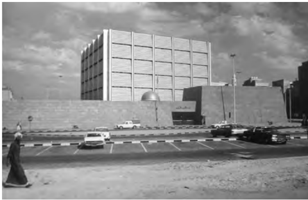
FIGURE 8. Kuwait Central Bank, designed by Arne Jacobsen.