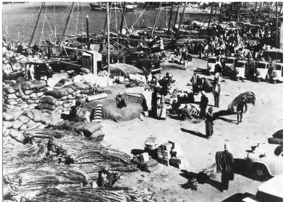
FIGURE 2. The seafront where the trading ships unloaded their wares before oil.

around the world. As Andreas Huyssen has argued: "The price paid for progress was the destruction of past ways of living and being in the world. . . . And the destruction of the past brought forgetting." 11