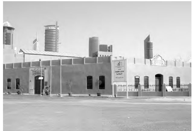
FIGURE 19. The juxtaposition of pre-oil buildings and present-day skyscrapers.

To return to the built environment, only making room among the new twenty-first-century skyscrapers for pre-oil heritage sites creates a direct link between then and now, while eliminating everything that happened in between. (FIG. 19) Even a mural painted on several bridges in Kuwait today juxtaposes mud-brick houses on one side with glass-and-steel highrises on the other, the bridge itself making it easy to cross from one era to the next (FIG. 20). This juxtaposition projects a straightforward, linear image of progress: look how far Kuwait has advanced in only sixty years (similar to the linearity in the words of Stephen Gardiner that opened this article). If, instead of comparing Kuwait today to where it was sixty years ago, we continue to contrast the present with the pre-oil past, then once again things do not look that bad now. But to critique Kuwait's modernist project and identify its shortcomings and failures — which in itself is a valid and necessary undertaking — should not also be to negate or for-