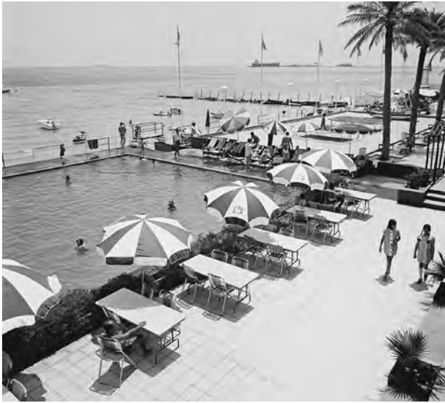
FIGURE 17. The Gazelle Club in the 1960s.

sidering public needs and desires when designing the new cityscape, the pavilion inadvertently perpetuated the uncritical idea that “modernity” could be, and indeed was, “acquired” — carefully planned and constructed after 1950 rather than having any roots in Kuwait’s own pre-oil past.