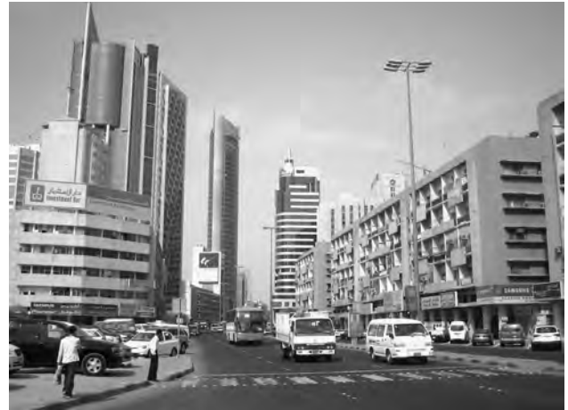
FIGURE 13. New highrises along Fahad al-Salem Street in 2008.

creased FARs exponentially, allowing buildings to rise up to a maximum of 100 stories, depending on plot size. This led to a flurry of demolition and construction activity, as the iconic lowrise modernist landscape was rapidly replaced by more profitable glass-and-steel highrises (FIGS. 11–13).