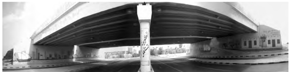
FIGURE 20. A bridge with a mural of Kuwait's pre-oil landscape on one side, and today's urban landscape on the other.

get the era in which the process played out, as that era holds a crucial place in Kuwait's history. It should not, therefore, be disregarded as illegitimate. Relegitimizing Kuwait's adolescent years as a valid era within the broader narrative of the country's history can provide a more critical understanding of where Kuwait is today — and, perhaps more importantly, where it is heading.