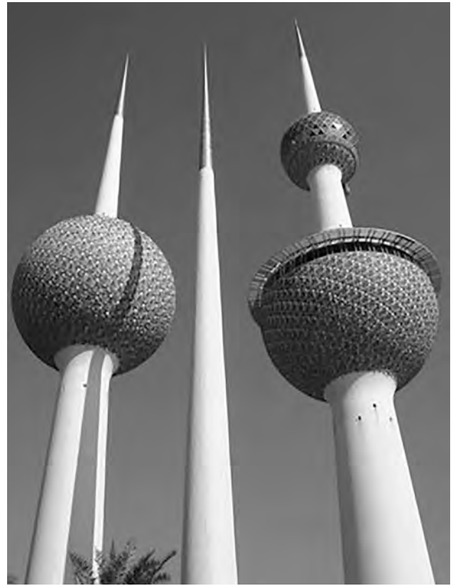
FIGURE 10. The Kuwait Towers, designed by Malene Bjorn.

As an active and busy port, Kuwait had been a cosmopolitan city well before the coming of oil — as Rhoads Murphy