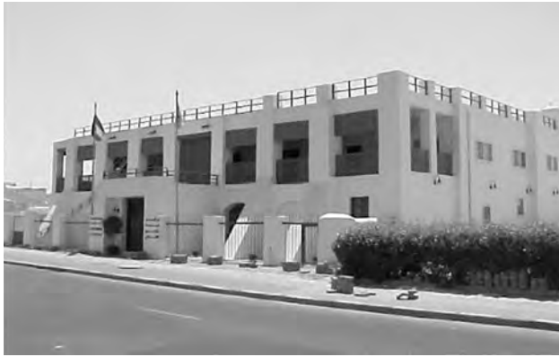
FIGURE 14. The renovated Dickson House Cultural Center.

and constructed by a Persian mason who, Dr. Stanley Mylrea recounted in his memoirs, was the first local builder he had come across who used the proper tools to ensure that lines were perfectly straight, perpendicular and symmetrical — all traits largely absent in local architecture (FIG. 16). 44 Again, there was never a singular cultural identity in pre-oil Kuwait, and the mixed architectural influences of the post-1950 period are arguably, therefore, as legitimately meaningful as what now “counts” as legitimate heritage.