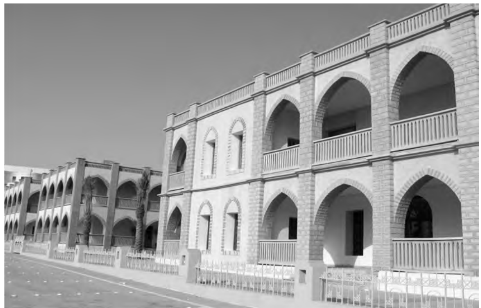
FIGURE 16. The renovated American Missionary Hospital.

come part of a postmodern quest to return to some perceived premodern essence. Even voices sympathetic to the modernist landscape tend to focus on the idea that “modernity” was an imported concept in Kuwait, as seen above in Kuwait’s participation in the 2014 Biennale di Venezia under the title Acquiring Modernity . 45 (Remember how the pavilion’s publication claimed that “Kuwait sought foreign consultants to tell us how to be modern.” 46 ) Although the authors of the publication rightfully critiqued the state’s planning paradigm for not con-