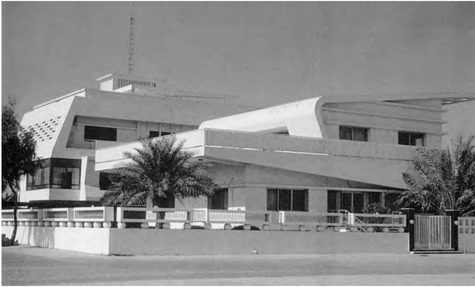
FIGURE 6. A typical new modernist villa in the suburbs.

of the traditional way of life and a sense of affluence toward a modern living environment. 28 This was reflected in the way they designed their new spatial surroundings. Villas, apartment complexes, offices, and government buildings were designed borrowing international architectural influences as diverse as California space-age googie, art deco, brutalism, and Bauhaus modernism, and mixing these with stylistic features like the colonial verandah and Arab mashrabiyya . Such eclectic architectural experimentation revealed the excitement and flux of a country rapidly transforming and eagerly searching (FIG. 6).