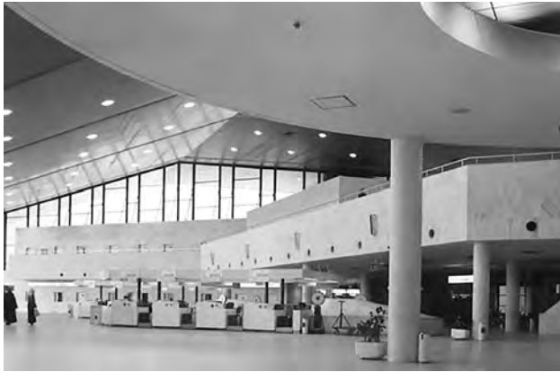
FIGURE 7. Kuwait International Airport designed by Kenzo Tange.