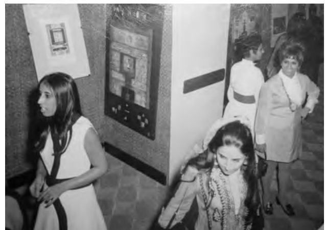
FIGURE 5. The Sultan Gallery.

The excitement of the period was vividly captured in the country’s dramatically changing urban landscape. According to the Kuwaiti architect Huda al-Bahar in 1985: “Kuwaitis began to experience a sense of freedom from the constraints