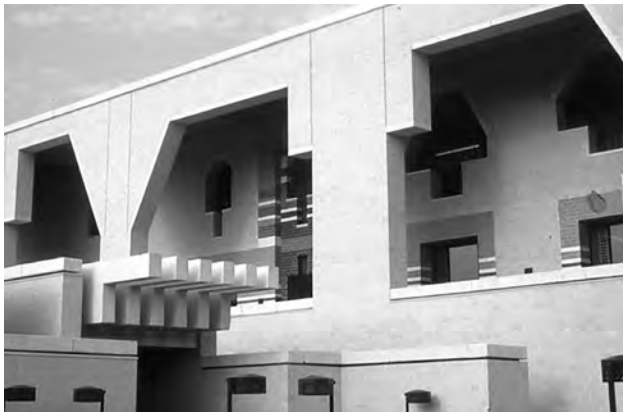
FIGURE 9. Seif Palace Extension and Ministry of Foreign Affairs designed by Reima Pietilä.

urbanism, it did nonetheless reflect continuity in Kuwait's cultural identity, insofar as that identity had itself been historically mixed.