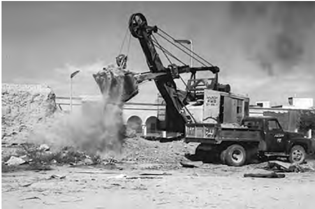
FIGURE 3. The demolition of the pre-oil town.

One planner working in Kuwait in the 1960s noted that Kuwaitis at this time demonstrated “an unquenchable zeal for development.” 12 When Zahra Freeth told a group of Kuwaiti women in 1956 that she had been taking photographs of some of the older houses in the town, the women grew “impatient at my interest in the Kuwait of the past, and asked why I wasted time on the old and outmoded when there was so much in Kuwait that was new and fine.” When Freeth mentioned that many of the old buildings were due to be demolished, one young woman exclaimed: “Let them be demolished! Who wants them now? It is the new Kuwait and not the old which is worthy of admiration.” 13 The mass demolition of the pre-oil landscape was not simply a means of clearing space for something new; it was a conscious act of erasure — of deliberately shedding Kuwait’s past while dreaming of a better future. Kuwait was coming off the heels of the worst economic recession in its history, and so, as Gardiner put it, “the optimistic prospect of a gleaming new city to replace the muddle, poverty and primitive conditions would have seemed irresistible.” 14