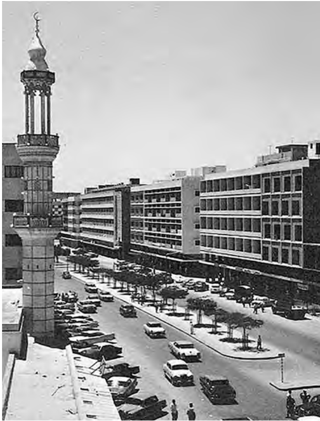
FIGURE 11. The new modernist Fahad al-Salem Street in the 1960s.