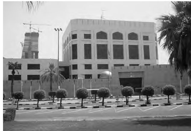
FIGURE 18. The Kuwait Central Bank as redesigned using Islamic architectural motifs.

Erasing Kuwait's modern era not only forgets these aspects of the past, but also validates the new and (unrecognizably) conservative present through the creation of an invented, usable, increasingly anti-modern past, culminating in the crowning of Kuwait as the 2016 Capital of Islamic Culture. With its emphasis on Islam, this designation invalidates such cultural productions as the Sultan Gallery (Kuwait's first center of modern culture); the famous 1983 Kuwaiti play Bye-Bye London , which was set almost entirely in a London hotel lobby bar in which the main Kuwaiti character gets drunk; the iconic modern Kuwaiti artist Sami Mohammed's bronze nude sculptures; the famous seaside Gazelle Club where middle-class Kuwaitis and expatriates sunbathed, danced, and drank alcohol; and other expressions of Kuwait's modern era. Nothing reflects this constructed "modernity