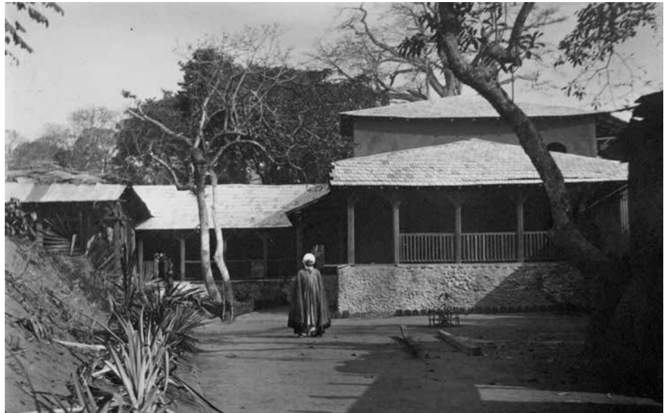
FIGURE 1. “Foumban: the King’s new palace, seen from the rear.” This was one of the new structures created under Sultan Njoya, ca. 1908/1909.

pear where material allows and a need exists.” Indeed, ethnic groups to the north and west of the Grasslands, including the Batammaliba (Tamberma), the “Ssola” in northern Togo, the Somolo in the “Black Volta,” and the Hausa in northern Nigeria, used mud-brick construction to build arched openings and multistory structures. 22 Njoya had certainly been exposed to some of these practices through travel, encounters with travelers, and Arabic texts, and he and his builders may have drawn on them in their designs for new royal structures.