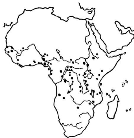
24. The post dwelling house.

FIGURE 3. (a,b,c). Telluric-Ethiopian Cultural Traits in Architecture. Source: Leo Frobenius, "Early African Culture as an Indication of Present Negro Potentialities," Annals of the American Academy of Political and Social Science , Vol.140 (November 1928), pp.153-65.