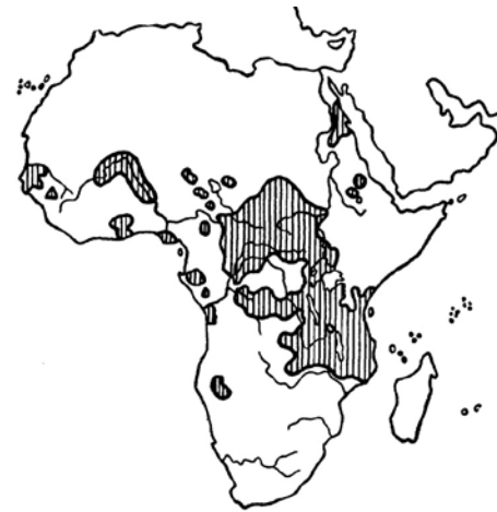
22. The post bed.

It is clear that Frobenius's proclivity for Africa had multiple origins. On the practical side, he saw in the continent his own professional salvation. Intellectually, the ethnologist was convinced that Africans were "living documents of an otherwise unrecoverable universal human past" — though only traces of this past remained in contemporary African societies as a result of foreign contamination. 40 Although Frobenius's emphasis on preserving authentic cultural forms contained anti-imperialist elements, he never explicitly condemned the colonial system. He may have acquired a passion for past African cultures, but he nevertheless subscribed to one of colonialism's most pernicious tenets — the contemporary superiority of Europeans. 41 Frobenius thus formulated a new Barthesian-type mythology — one that valorized the victims of colonialism and their cultural artifacts even as it continued, in the words of Denis Dutton, to "perpetuate acts of imperialism, appropriation, and ethnocentric insensitivity . . . in the name of enlightened, magnanimous liberalism." 42 This new mythology was positioned (on the surface) in opposition to an older mythology that directly and unapologetically justified co-