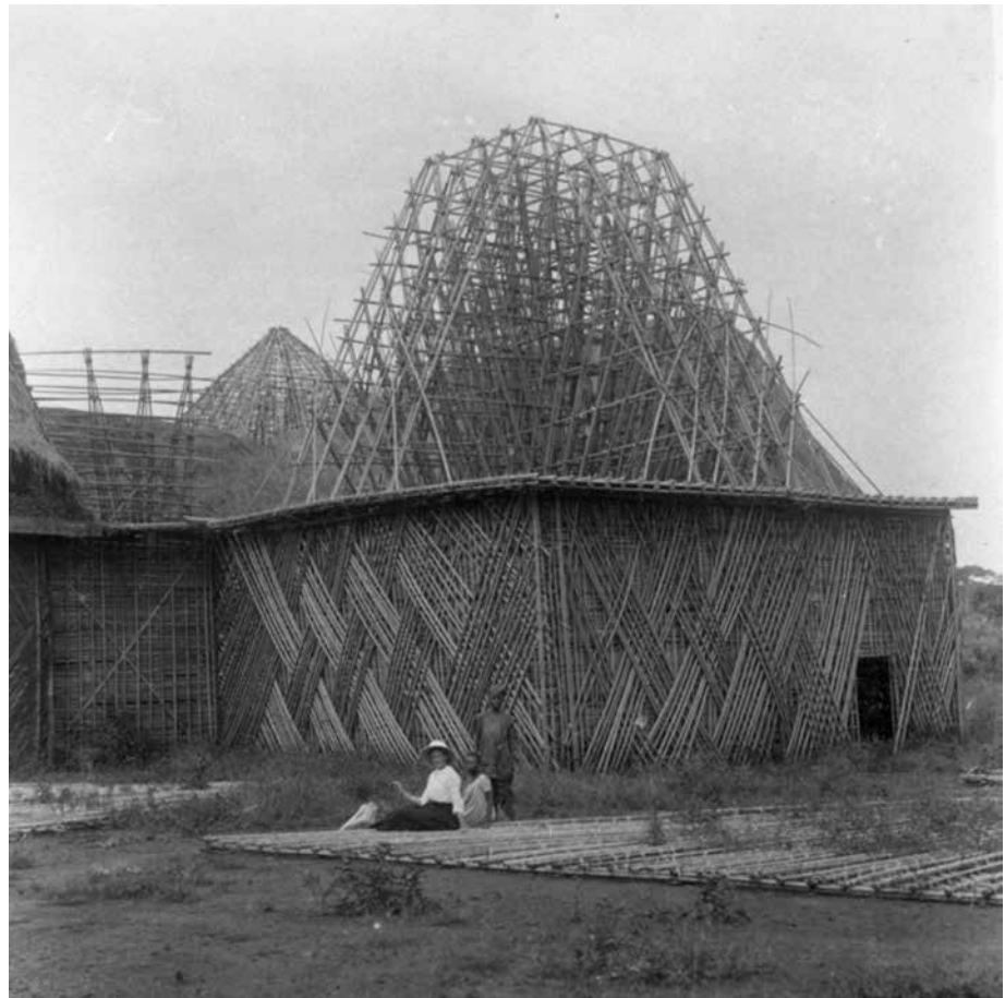
FIGURE 4. Building a house in Bamum.