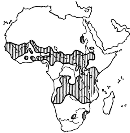
23. The post granary.