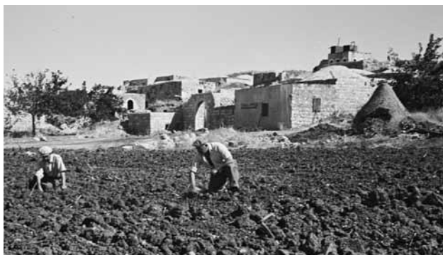
FIGURE 5. Moshav Tirat Yehuda, 1949.

The pioneer-settlers of Tirat Yehuda initially occupied the vacated stone and earth houses of Al-Tira (FIG. 5). They were employed by the JA in road construction until new houses and fields were laid out. Then, in 1950, the JA supplied them