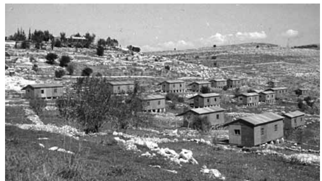
FIGURE 10 (TOP). Immigrants employed in public works, Eshtaol work village, 1950. Eshtaol housing in the background.