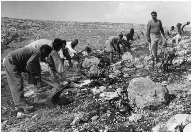
FIGURE 12. Ksalon: employment of dwellers in stone-clearing, 1950.