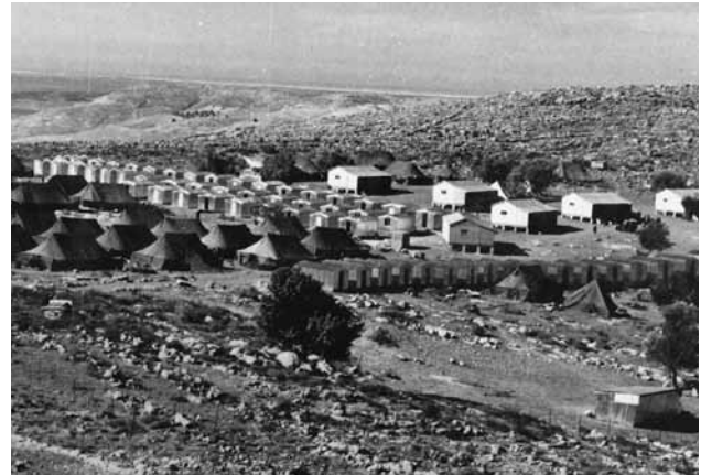
FIGURE 13. Ksalon Maabara, December 1950.

temporary dwellings were located next to existing towns, villages, moshavot , moshavim and kibbutzim across the country. The aim was to employ the immigrants in the economies of these settlements — and, no less importantly, to use the interaction with veteran citizens to acculturate them to a pioneer life of self-governance and self-subsistence. 73