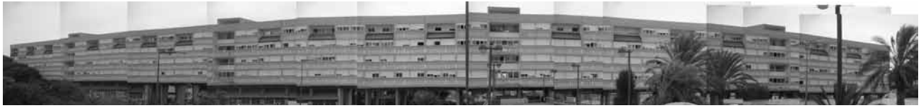
FIGURE 20. Quarter Kilometer housing block, Beer Sheba (Architects Yaski and Alexandroni, 1962). Panorama taken 2007 by Eran Tawil Tamir. Source: arsitectura.com .

(FIG. 20). 93 Records show the Sharon master plan initially included permanent immigrant housing identical to housing built for “veteran” citizens at the time.