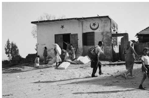
FIGURE 3. New immigrants from Yemen moving into vacated houses at Aqir, 1949. Photograph by Hugo Mendelson. Source: NPC, reprinted by permission.

grew by 181 percent, that of the Beer-Sheba district grew by 1,779 percent, and that of the Tel Aviv district grew by 87.2 percent. 32 The Ramla district can therefore be identified as the most significant area for immigrant settlement during the early years of Israeli sovereignty. Moreover, the majority of the new settlements there were based on agriculture, the activity best suited to forming new citizens and protecting the nation's borders, as defined by state leaders. 33