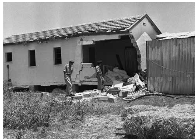
FIGURE 6. Tirat Yehuda house after the attack. Photograph by Brauner Teddy, June 10, 1953. Source: NPC, reprinted by permission.

The border location of Tirat Yehuda meant an everyday reality of attacks by infiltrators across the Jordanian border. These attacks generally amounted to sabotage and the theft of crops. The most lethal attack on Tirat Yehuda, in June 1953, included shooting and throwing a grenade into one of the houses, resulting in the death of one resident (FIG. 6). 46 In the eyes of the state, the activities of the Tirat Yehuda immigrants — building their own homes, securing the border, and cultivating the homeland — marked them as well-formed citizens.