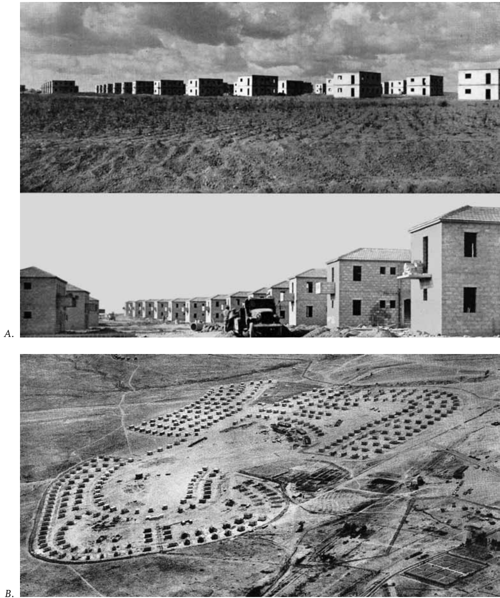
FIGURE 18A,B. First neighborhood unit (A) of the new Beersheba.

scholarship. 90 But the Sharon plan and Beersheba neighborhood A attest that development town housing was initially a replication of “proper” pioneer core housing. Thus, the housing in Neighborhood A actually comprised two-story buildings each containing four one-bedroom apartments of 26–32 square meters. 91 These houses were further allocated large parcels of land in anticipation of their future expansion by residents according to the principle of self-help. 92