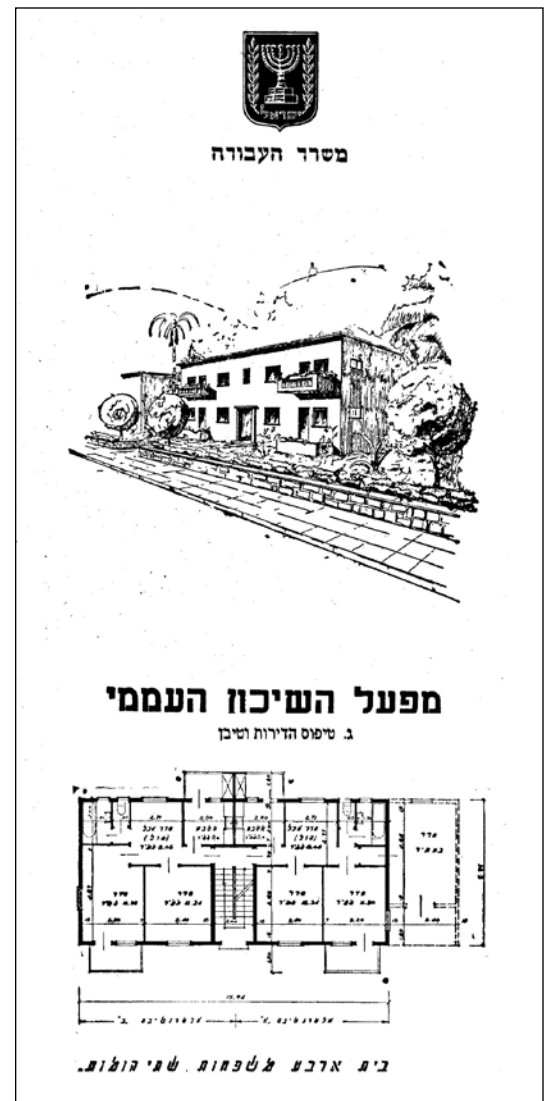
FIGURE 17. The Popular Housing Enterprise, designated for “veteran” citizens, Ministry of Labor brochure, 1951. The brochure, issued by the Ministry of Labor, specifies eligibility for the “popular housing” enterprise, which included primarily veteran immigrants living in insufficient housing conditions.

As Zvi Efrat has pointed out, “development town” planning as reflected in the Sharon plan essentially proposed