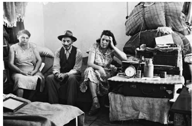
FIGURE 9A, B. Immigrants in the Sha’ar Aliya reception camp, 1949.