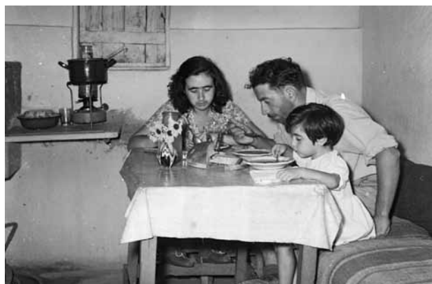
FIGURE 2. New immigrants from Bulgaria living in a room in a vacated house in Jaffa.