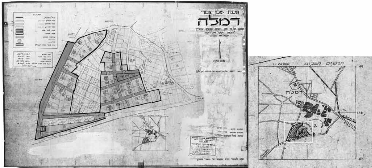
FIGURE 7. Ramla public housing plan 3/57/5 of 1967, prepared to meet the 1964 law of public housing registration. The plan regulates the 1964 condition of original shacks (in right plan) and new structures (in contour). It is important to note that the plan was outlined long after the neighborhood had been populated, for the purpose of registration. The housing preceded the planning by some fifteen years. Highlight box by author.

Urban Subsistence Farms. The internal border of the Ramla district — namely, the Arab city of Ramla itself — was addressed by planning several new Jewish neighborhoods to surround and contain it. The first of these (and a laboratory for the Ramla urban plan) was the Amidar Shacks neighborhood, erected right outside the Arab city in early 1950. It combined urban housing and land cultivation in the form of self-help subsistence farms (FIG. 7). The neighborhood included some fifty wooden shacks, each serving two families. According to this plan, each family was allocated a living space of 8 by 4.2 meters (34 square meters) and a plot