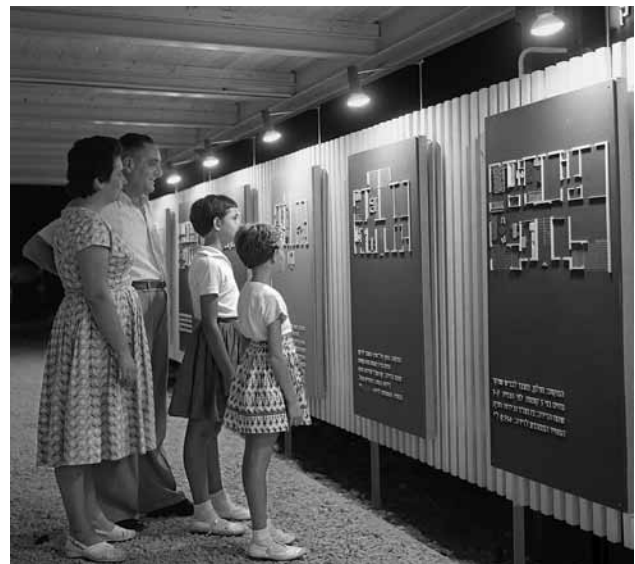
FIGURE 15. Model housing exhibition, 1950s. Note the expectancy of regular citizens to read and understand architectural plans.

The Sharon plan was first presented to the public in February 1950 in the framework of a public exhibition at the Tel Aviv Museum of Art, which was aimed to make the public more “planning-minded” (FIG. 15). 83 The exhibition included a series of posters outlining in a popular way the challenges identified by the planners and describing their operational principles. The plan was well underway at the time but had not yet been completed and approved by the government. It was eventually published in Hebrew in 1951 under the title “Physical Planning in Israel 1948–1953.” 84 In that document Sharon stated that his team had “tried very hard to gain the support of public opinion for our national planning,” and that the effort was “fully backed” by the powerful prime minister, Ben-Gurion. 85 This important statement expressed the perception that the public was a sovereign force that should be convinced to approve it.