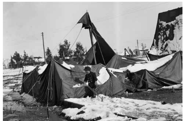
FIGURE 14. Rosh Ha'ayin Maabara, February 1951.

Of course, the immigrants’ perceptions had solid grounds; strong racial sentiments did exist within the veteran