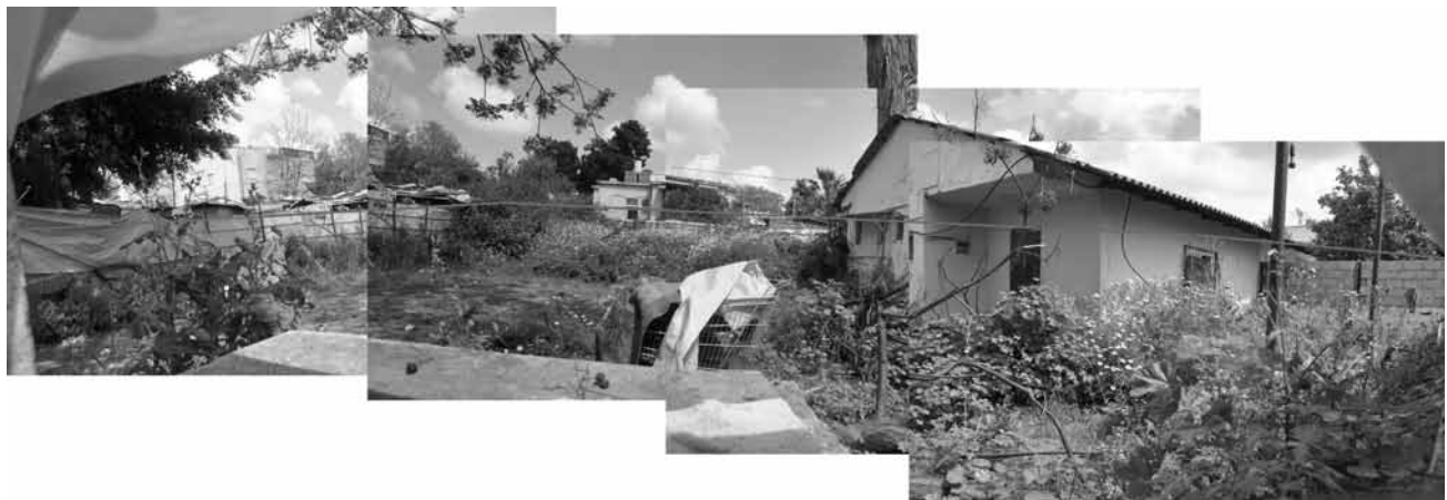
FIGURE 8. One of the shacks still standing at Massada Street, no. 35. Note the small structure serving as toilet at the very back of the plot. Photo collage by author.

The small plots represented the fulfillment of the Zionist dream. They provided each immigrant family with a subsistence farm and a main source of livelihood during the decade-long austerity period instated by the Israeli government from 1949 to 1959. 48 People who had access to land