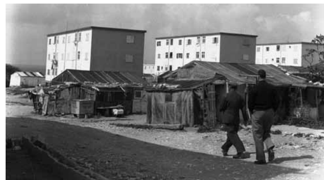
FIGURE 19. From maabara to permanent housing. David Maabara dwellers moving to permanent housing constructed for them, 1960.

The permanent housing plan thus led to the gradual housing of maabara dwellers through the 1950s in units similar to veteran citizen housing (FIG. 19). Social unrest was accordingly curbed. It was only later, in the mid-1960s, that the housing typology constructed to serve immigrants changed dramatically to include the distinct architecture of “Unité” mass housing blocks, termed shikun in Hebrew